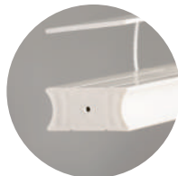
Bottomrail-Hollow Extruded PVC