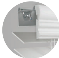
Crown Valance with low profile headrail

Painted steel with hinged locking front cover.