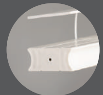
Bottomrail - Hollow Extruded PVC

THE BEAUTIFUL LOTUS & WINDOWARE 2" FAUX WOOD BLIND OFFERS THE WARM LOOK OF WOOD AT AN AFFORDABLE PRICE. The 2" Faux Wood Blind is engineered using a unique steel headrail with new memory flexibility technology making it more durable. The specially engineered hollow bottomrail makes operation smooth and holds slats in perfect alignment.